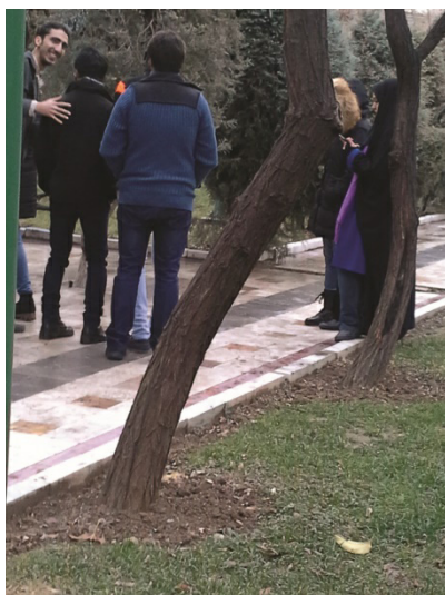
Picture 3 & 4: Atousa Park, across from Faculty of Social Sciences, ATU