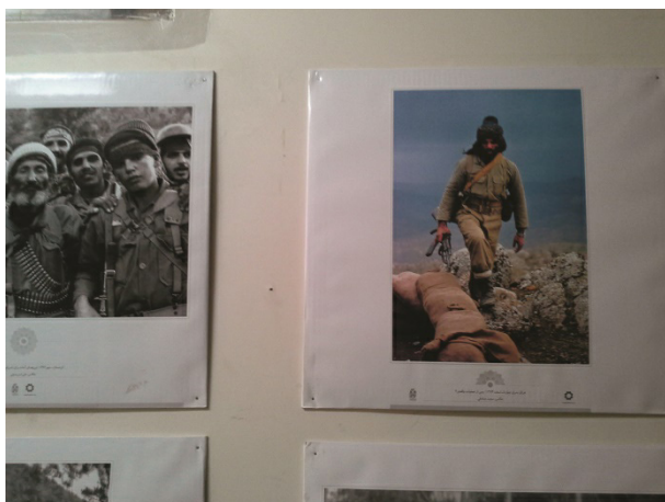
Picture 2. Office of Islamic Association of Students, AUT (with Principlist tendencies)